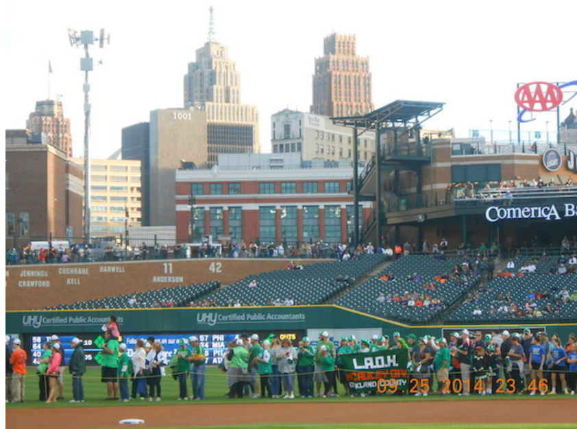
Detroit area Irish groups recognized on the field before the game.